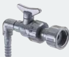
2. Pure water outlet valve