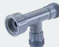
5. Pure water T-connector