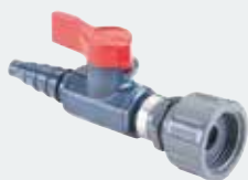
1. Pure water outlet valve