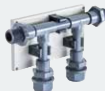
4. Pure water distributor block